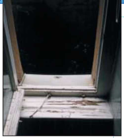
Leaky window — mold is beginning to rot the wooden frame and windowsill.

If you already have a mold problem — ACT QUICKLY.